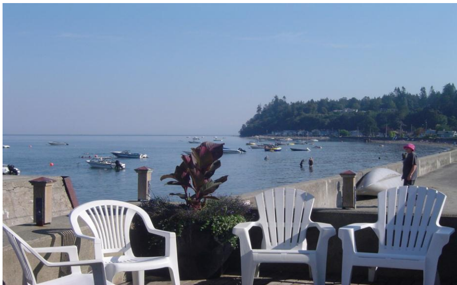
SUMMER 2010 AT BAYSIDE